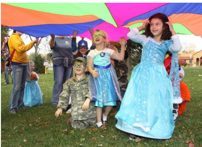
Fall Festival 2014

The vision of New Opportunities Inc. Head Start/Early Head Start is for all children and families to have a safe, healthy, nurturing environment to live, learn, and grow.